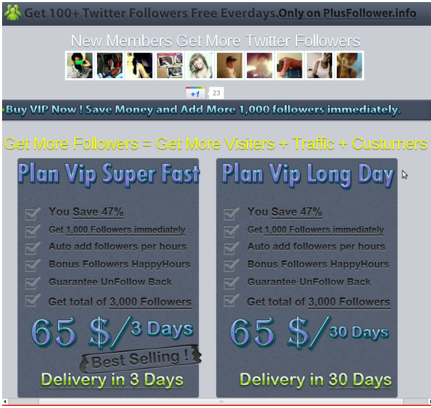
Figure 1: A Twitter Account Market