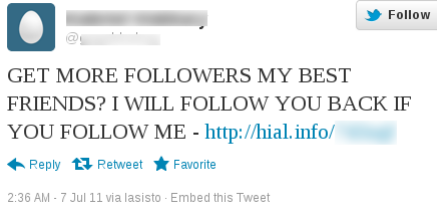
Figure 2: A tweet advertising a Twitter Account Market